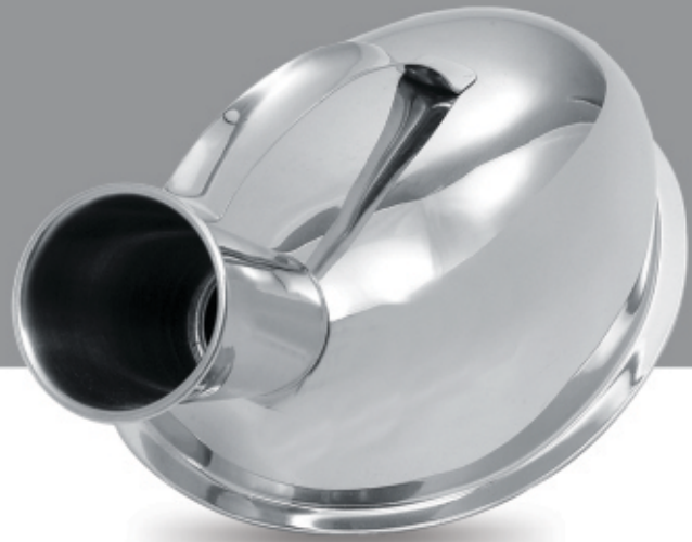
TWS 84-1002/07 Male Urinal

FEMALE URINAL Manufactured from 18/10 stainless steel. With handle.