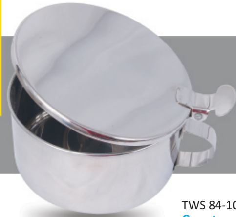
TWS 84-1001/46 Sputum Cup