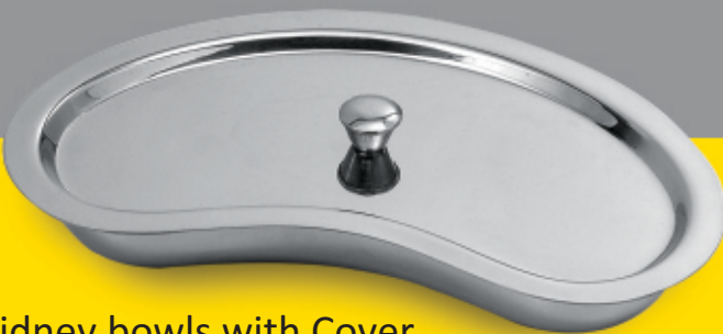
Kidney bowls with Cover

Manufactured from 18/10 stainless steel. Pressed without welding, complete with handle and lid.