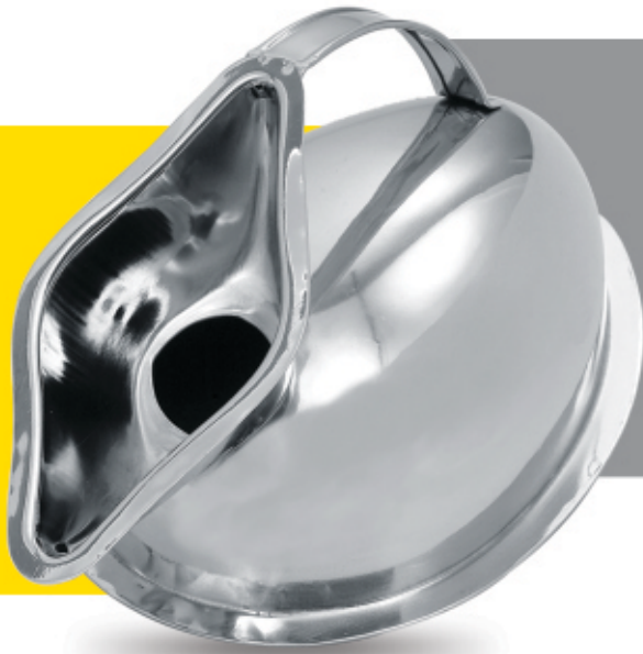
TWS 84-1002/06 Female Urinal

TWS 84-1002/04 Adult TWS 84-1002/05 Child