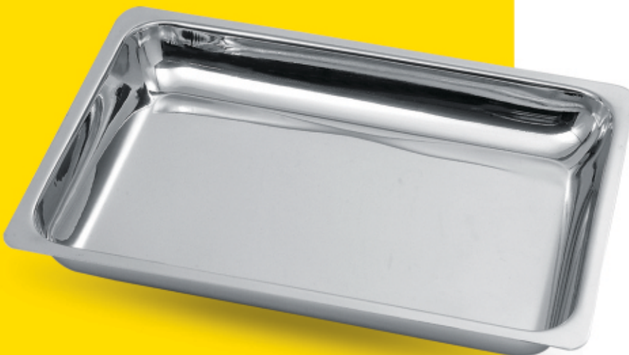
Instrument Tray with cover